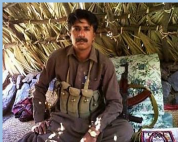
Dr. Allah Nazar Baloch (2003 – Present)

Dr. Allah Nazar Baloch was born in October 1968 in Mashkai, Awaran district of Pakistan. He started his career as a political activist and founded Baloch Student Organization (BSO-Azad) in February, 2002. BSO-Azad openly advocated armed struggle against Pakistan. In 2003, Dr. Nazar went underground to join insurgents